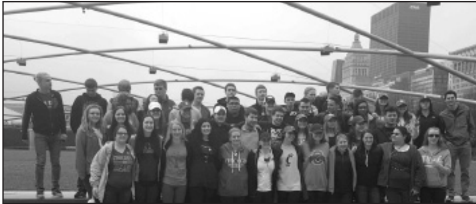
Seniors at the Millennium Park.