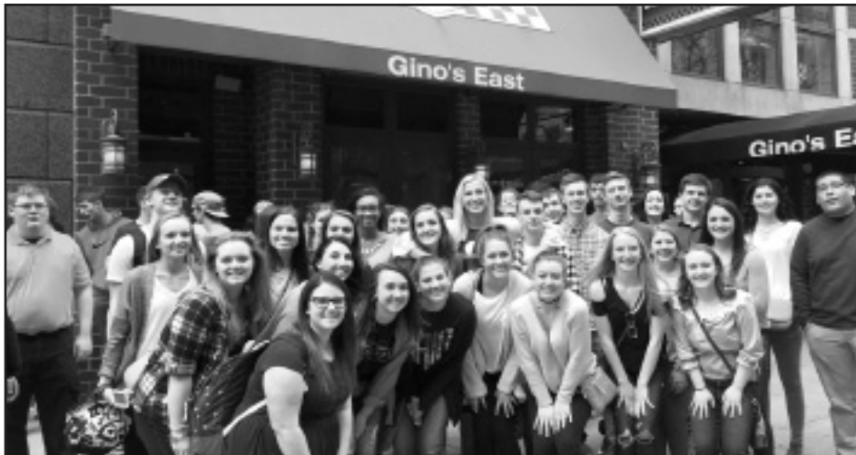
Hungry Seniors in front of Gino's East Pizza waiting to go to dinner on the third floor.