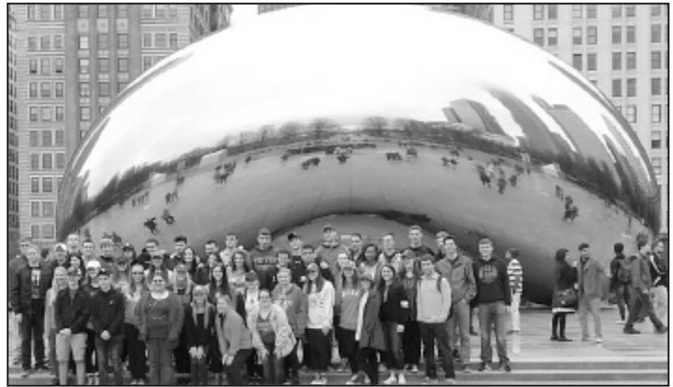
Senior Class posing in front of the "Bean".