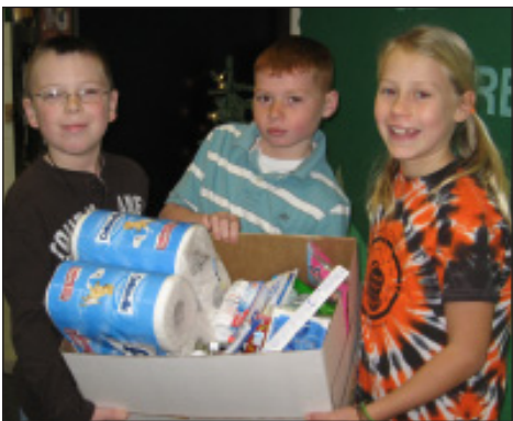
Soft toilet paper