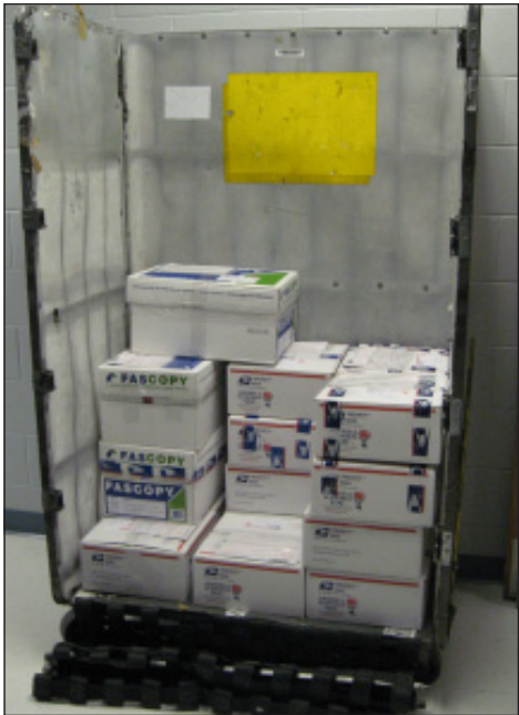
The metal postal cage filled with 23 boxes