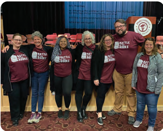
The Amazing Volunteers: