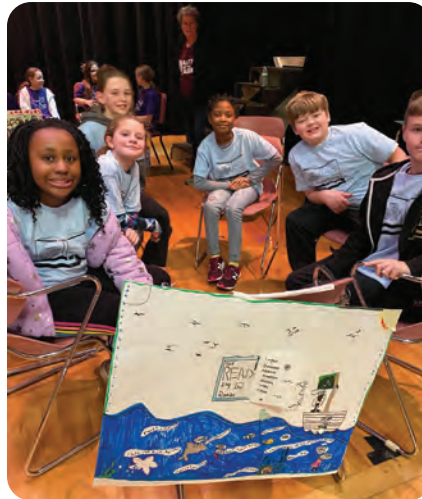
The Reading Riptides