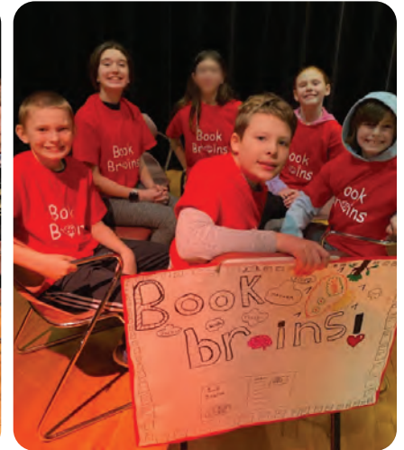
The Book Brains