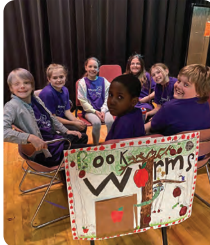
The Book Worms