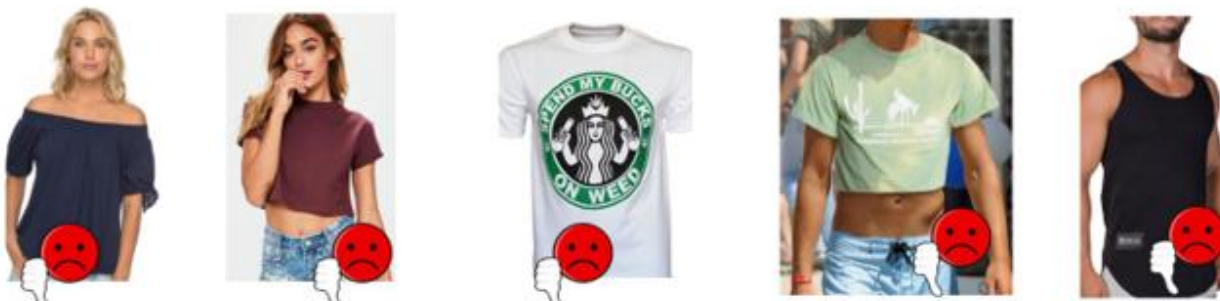
The following pictures do not cover the entire dress code. These pictures address some of the most common issues. If you have questions about a certain item ask one of the principals.

The following illustrations do not cover all of the dress code but does illustrate some of the most common problems.