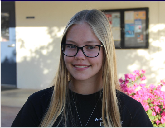
...continued from front page STUDENT OF THE MONTH