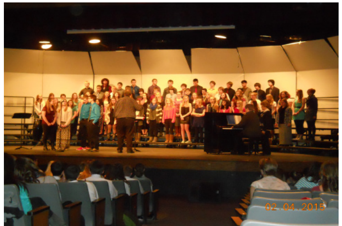
The 8th grade Choir sang at the Middle School Choir Festival at Byron Middle School on Wednesday, Feb. 4, 2015