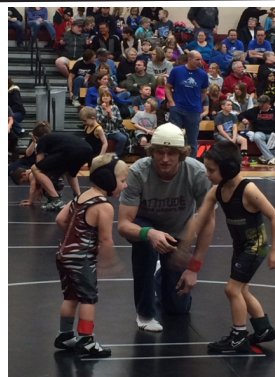
Cobra Collision Youth Wrestling Tournament