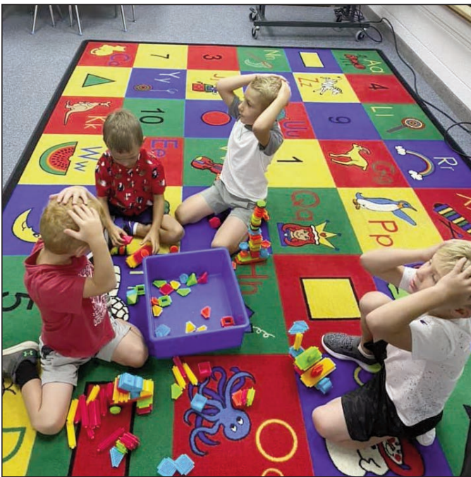
Kindergarten boys and girls in Ms. Proffer’s class practice new routines and procedures on their first days of school.