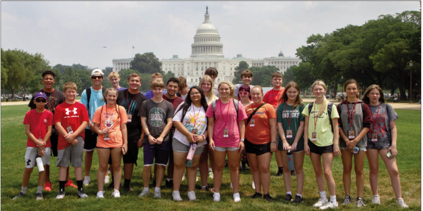
Students who made the trip to Washington enjoyed the sights and had a great time learning all the buildings in Washington D. C. they were able to visit.