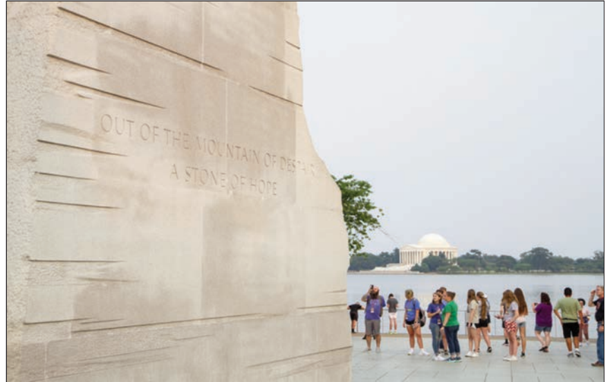
Panthers visit the Martin Luther King Jr Memorial, across the tidal basin from Jefferson Memorial.