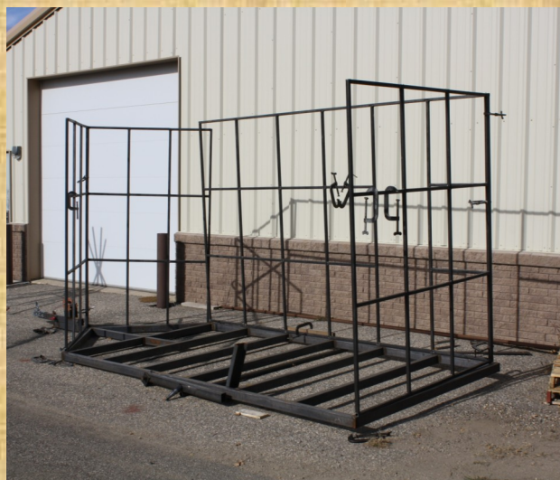
The advanced welding class is working on completing an ice shack frame for Lowell Looyenga.