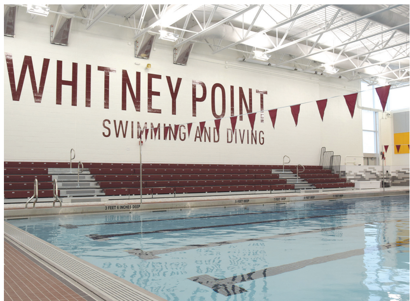
Newly reconstructed pool at Caryl E. Adams Primary.

If voters defeat a budget a second time, the school board must go to a contingent budget. A district that adopts a contingent budget cannot increase its tax levy from the prior year. For Whitney Point Central School District, that would mean reducing $507,000 from the budget. This amount also includes the required reductions for equipment spending. In addition, the district would be required by law to charge fees for public use of school facilities.