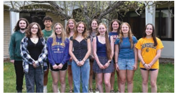
CFHS Students Earned the New York Seal of Biliteracy