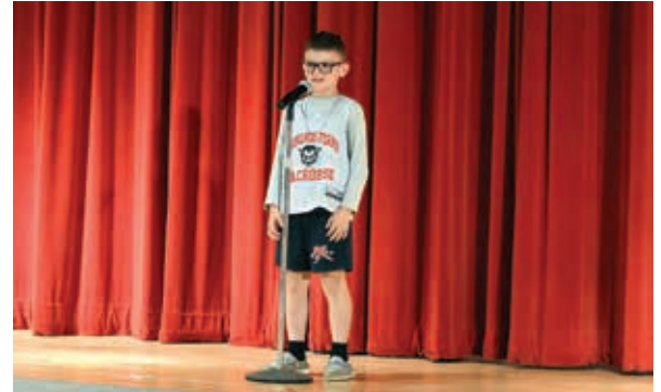
Impressive Work by All During the Second Grade Poetry Recitation