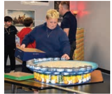
Builders Club Participated in the Annual Kids Can Build Challenge