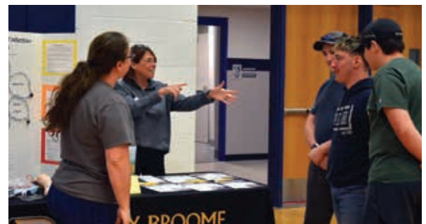
Students Connected With Many Local Organizations During The Health Fair

High School Graduation June 26, 2026 | 6 p.m.