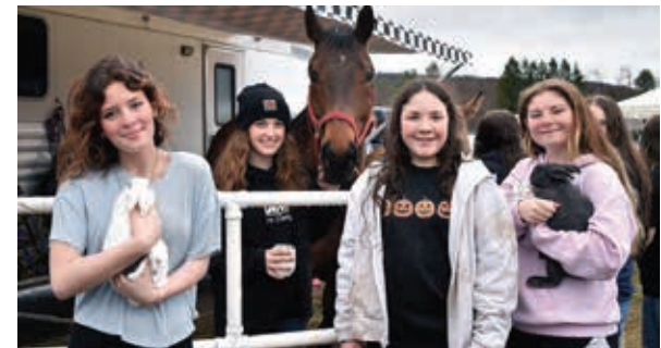
Ag Club Members Hosted Agriculture Day with Real Farm Animals