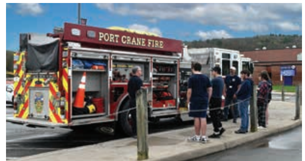
Students Learned About Local Volunteer Firefighting Opportunities