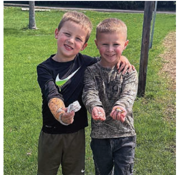
Earth Day Playground Clean-Up