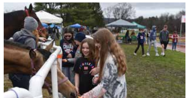
Students Explored a Variety of Booths During the Fourth Annual Agriculture Day

8th Grade Moving Up Ceremony June 23, 2026 | 9:30 a.m.