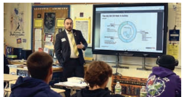
Financial Literacy Series Taught by KeyBank