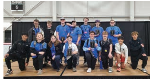
Middle and High School Teams Finished Second Place in SUNY Broome Robotics Competition