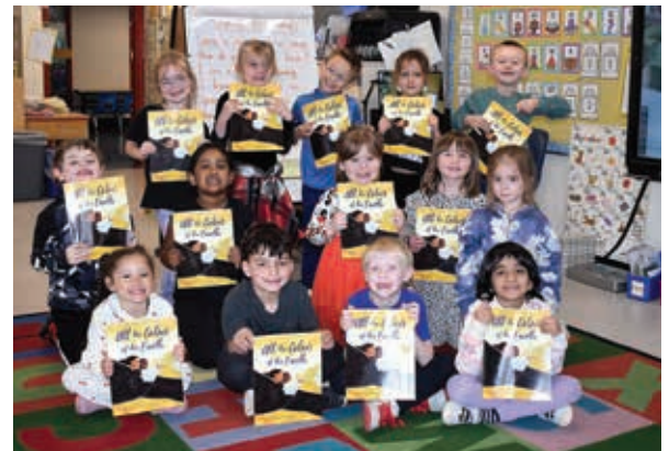
Kindergarten Students Enjoying Their New Books