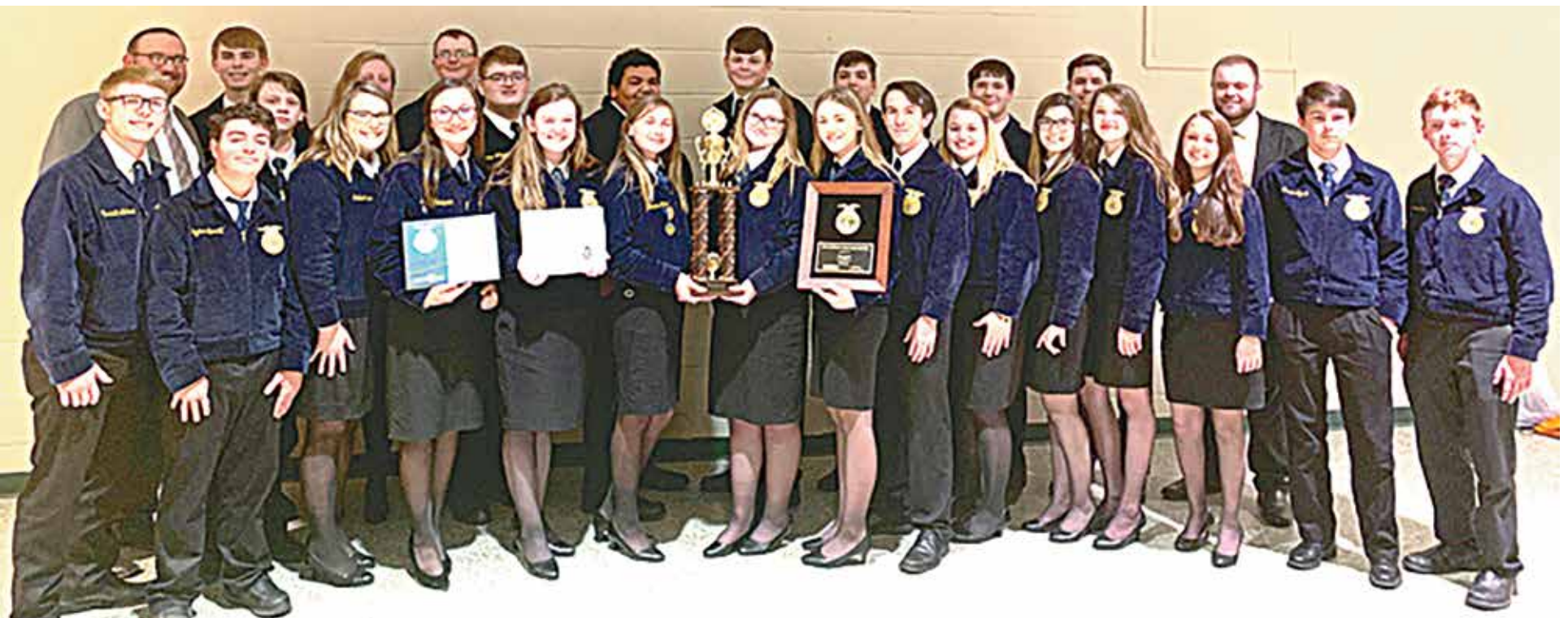
Coalgate FFA members at the state convention held May 1 in Oklahoma City. See page A-9

Coalgate FFA Banquet, Saturday, May 11 at 6:00 p.m. Coal County Fair Barn