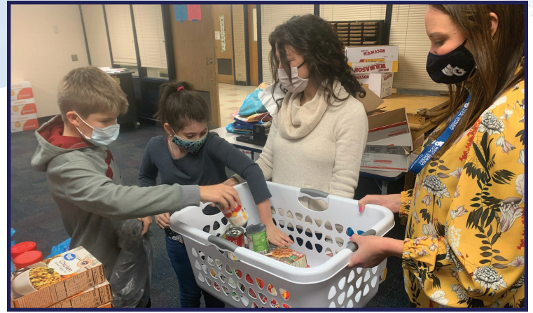
Lindsey Elementary student council members help generate non-perishable food items for the needy this holiday season!

On November 5, 2021, Lindsey Elementary came together for an academic celebration to applaud students and staff for the success achieved from state testing. PTO helped