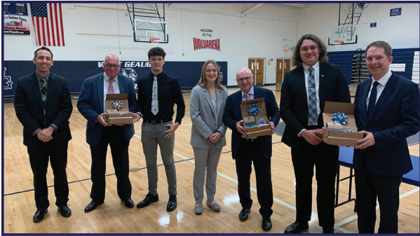
West Geauga High School students offer gifts from local businesses to the representatives from London, England, who joined us for a special ceremony on November 17th, 2021.