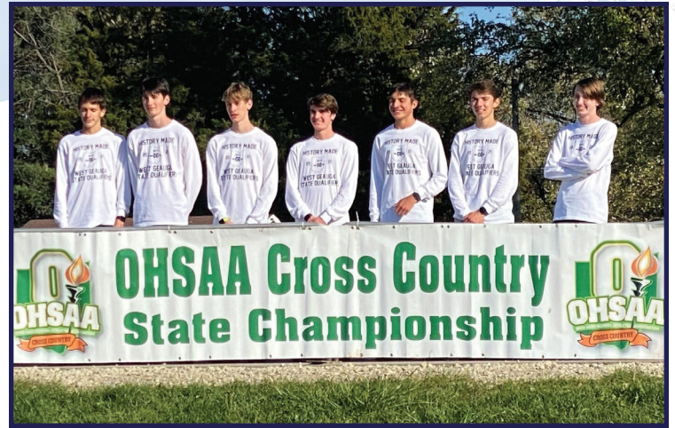
State Qualifying Boys Cross Country Team