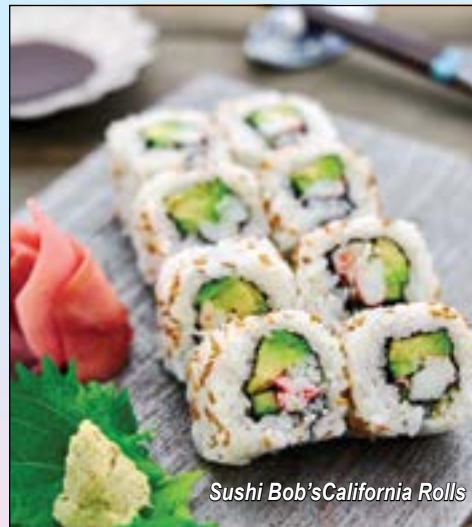
Sushi Bob's California Rolls