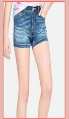
Shorts must be mid thigh or longer