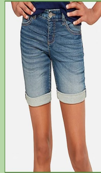
Shorts are mid-thigh length