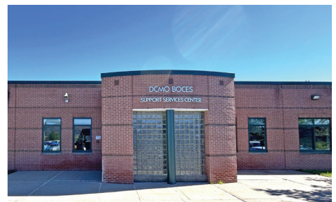
DCMO BOCES Alan D. Pole Campus in Norwich (left), Robert W. Harrold Campus in Sidney Center (center), and Support Services Center in Norwich (right).