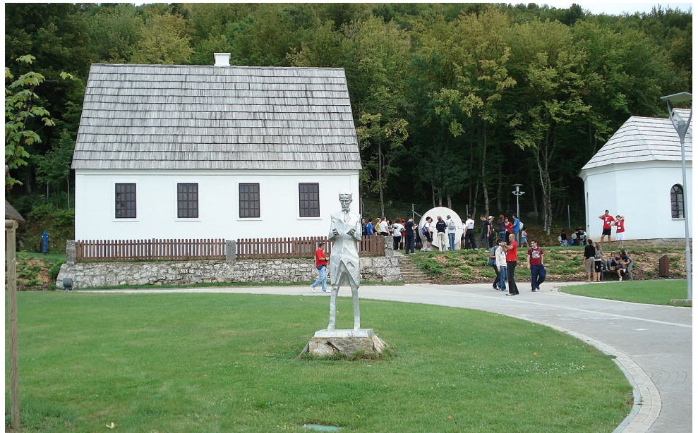
The Tesla birthplace has been reconstructed in Smiljan, Croatia.

Ultimately, Tesla's substantial impact can be seen throughout his life, as well as highlighted when he died on January 7, 1943 and will undoubtedly be discussed for years to come.