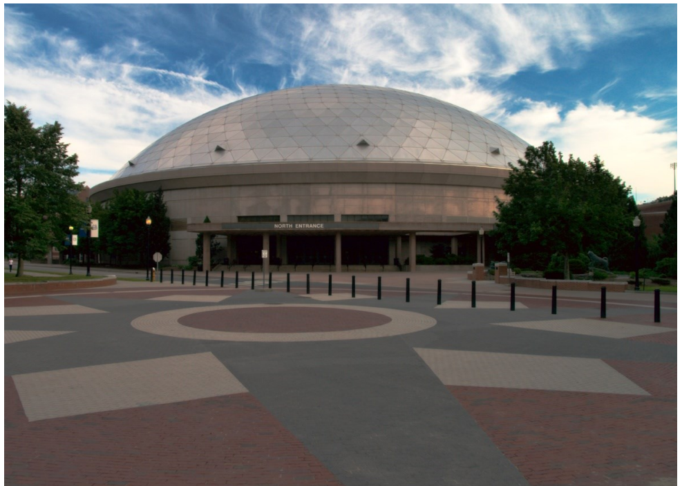
Gampel Pavilion, the home of UCONN Huskies Basketball!

Sure, the size of the campus is a little frightening to think about, but I believe that after a little while it'll all be fine and come to play.