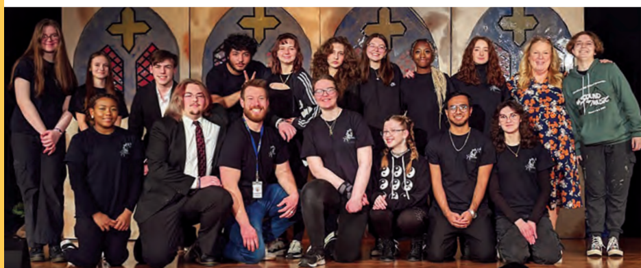
Congratulations to the cast and crew!