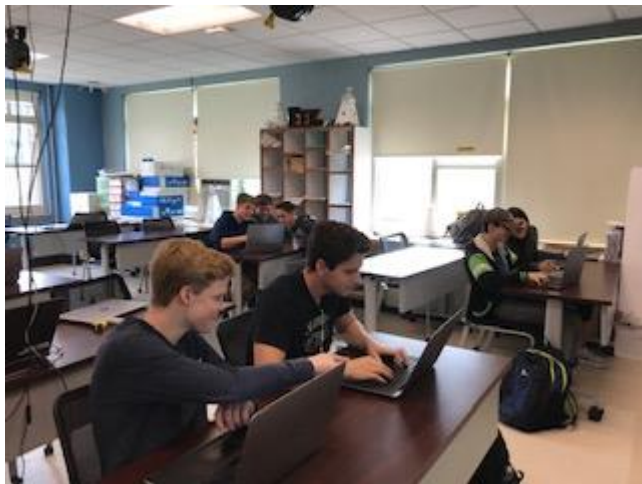
Intro to Computer Science