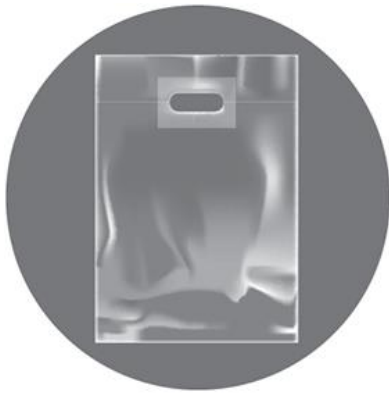
CLEAR PLASTIC BAG 1 GALLON BAG

Clear plastic bags (1 gallon size), clear tote bags (12" x 6" x 12") and small clutch bags (4.5" x 6.5") are allowed. All other bags are not.