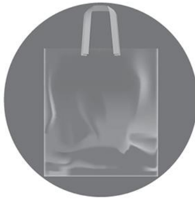
CLEAR TOTE BAG 12" X 6" X 12"