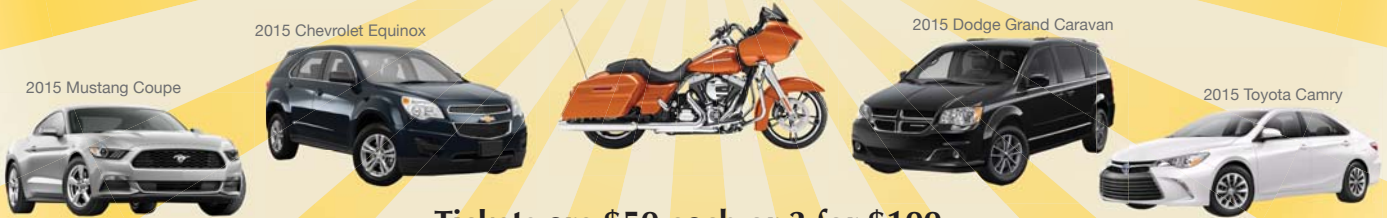
2015 Toyota Camry