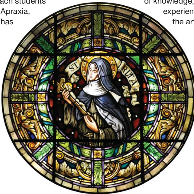
Stained glass window of St. Rita of Cascia, originally installed at Girls Town in Cincinnati, was restored and now holds a prominent place in the sanctuary at St Rita School for the Deaf.