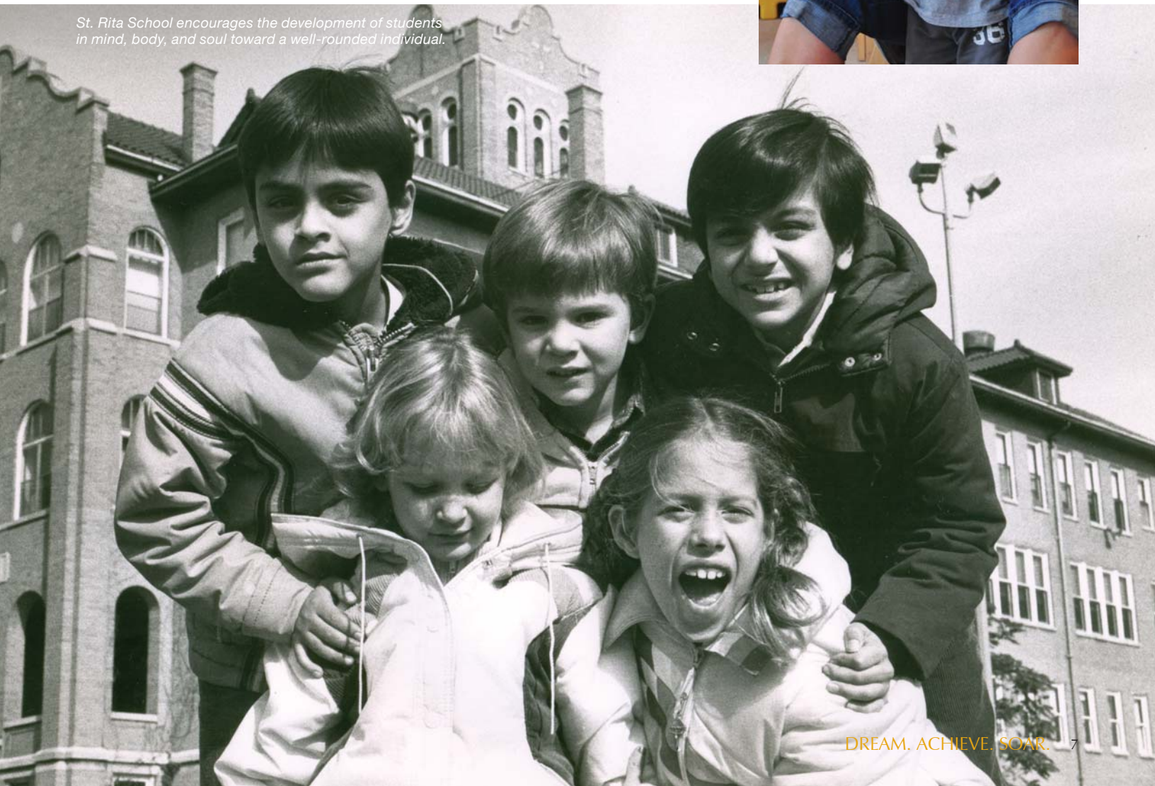
St. Rita School encourages the development of students in mind, body, and soul toward a well-rounded individual.