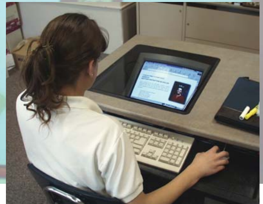
White boards and computers become the latest technology in the 1990's.

Deaf children from as young as six weeks of age. Small ratios, direct communication using sign language and individualized instruction lowers the frustrations of a young child and opens up avenues to allow for development and learning to take place.