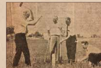
1964 Groundbreaking for Kettle Moraine High School

1965 Kettle Moraine High School Opened The school opened with approximately 280 freshmen and sophomore students.