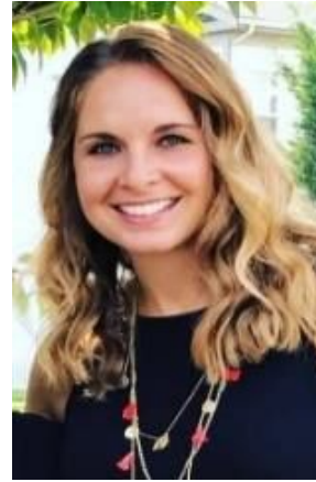
Hollie Wilee Briar Woods Cluster