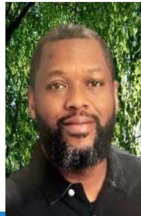
Byron Woodard Lightridge Cluster