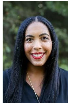
Nykea Purnell Independence Cluster Charter Schools Jail Programs Virtual Distance Learning