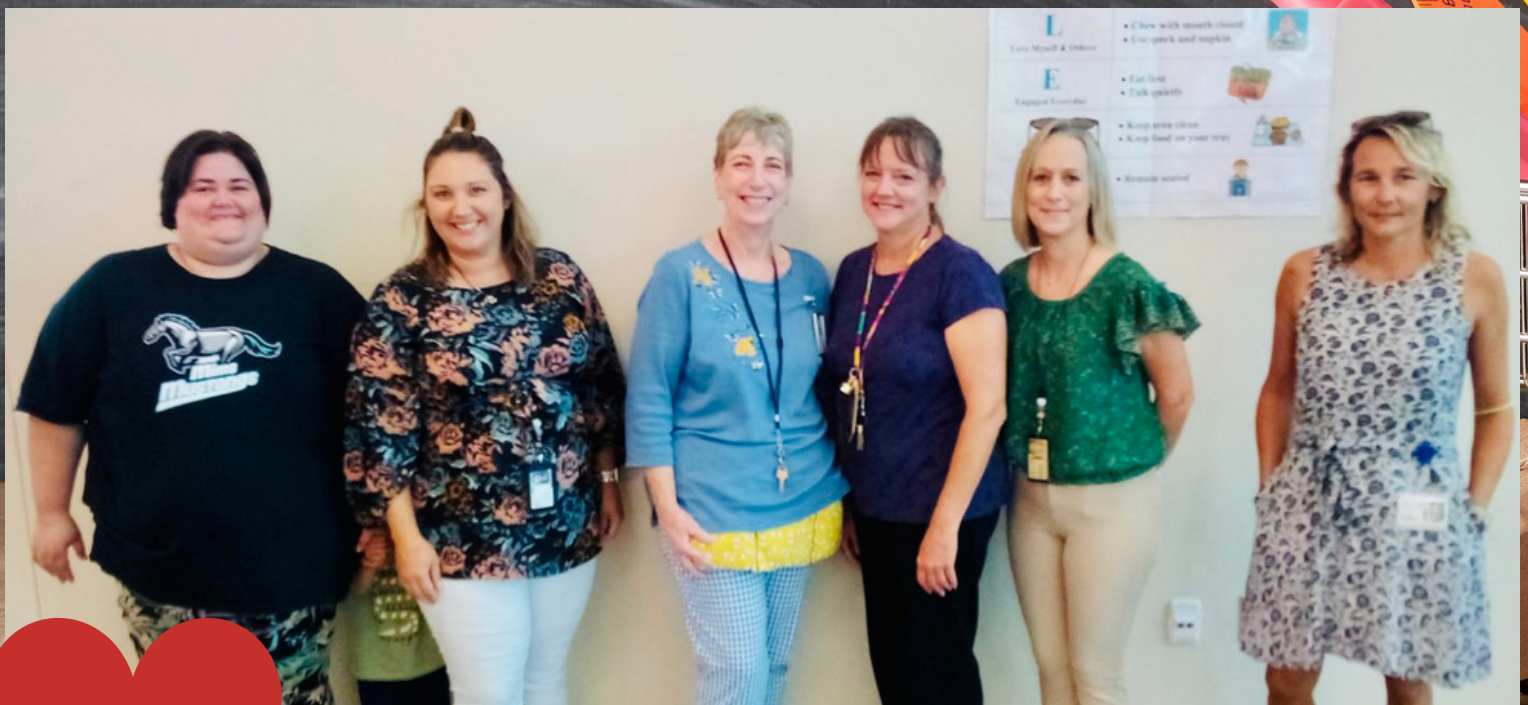
Our Mims Team