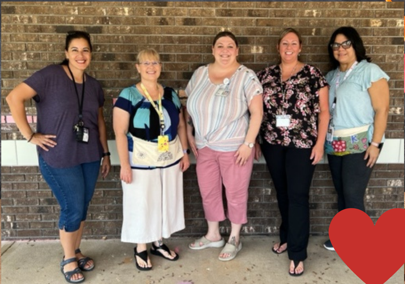
Our Discovery Team

We have 12 wonderful schools that have Head Start classrooms. Each school may have 2, 3 or 4 classrooms. We are very proud of the partnership we have with each school and the dedicated staff who support our children! We will include all schools team pictures in the next few issues of the Scoop newsletter.