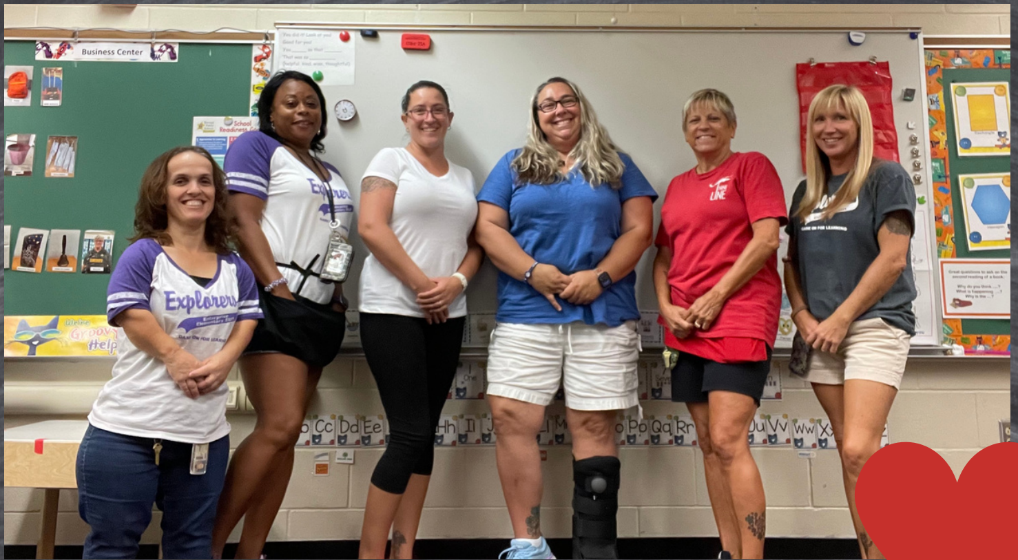
Our Enterprise Team