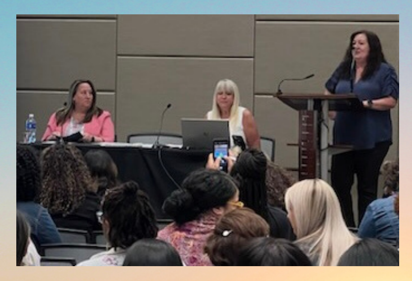
Great team work!