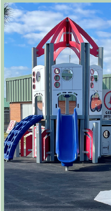
Photo: New Playground Gemini Elementary