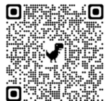
(website linked QR Code)

Breakfast and lunch are provided free of charge.