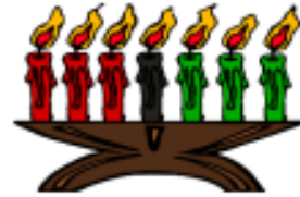
This Photo by Unknown