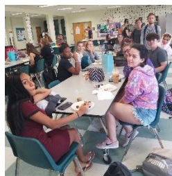
During Summer Camp, students collaborate, create, facilitate and implement team activities.