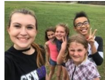
Real-world experiences at Atlantis Jump for Heart