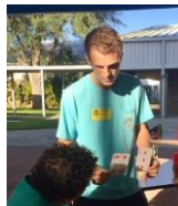
Atlantis alumna interns senior year