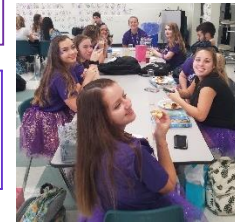
Thanks to students, parents and teachers, fun and food!