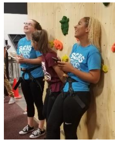
Teambuilding at Adventure Zone!

Upon graduation, students who complete this program and pass the industry certification ParaProfessional exam will be eligible to apply for positions related to public service fields and school systems throughout the state.