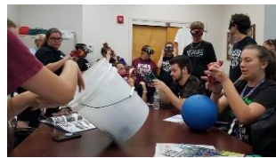
ATEPS students visit Flagler College and the Florida School for the Deaf and Blind in St. Augustine