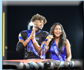
Homecoming Court Wrap up Page 2