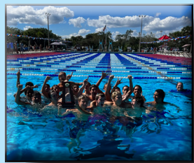
Fall sports wrap up, boys' swim/dive are District Champs again! Page 4