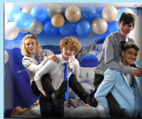
Homecoming Dance included all students 9-12th Page 3