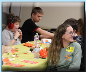
Best Buddies hosts huge Friendgiving celebration Page 8