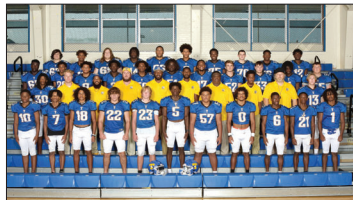
The varsity football team poses for their official team photo with the coaching staff in August. The team advanced all the way to the Regional level, with their season ending with a 3rd place finish, improving their results over last season.