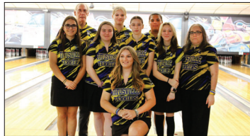
The girls' bowling team advanced all the way to State tournament this year and brought home a 9th place finish. This was the best results the team has earned in several years.

Stats most proud of - High percentage of scholar athletes on the team.