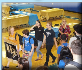
Senior Signing event, included college and military acceptance. Page 2