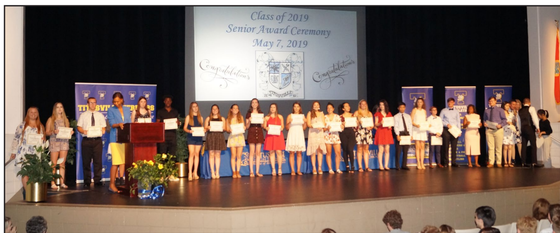
Seniors graduating with their Associates of Arts Degree from Eastern Florida State College