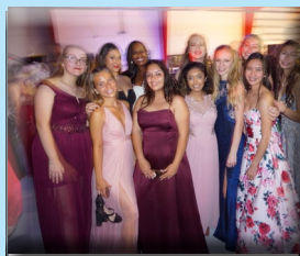
Prom enjoyed by juniors & seniors in April Page 3