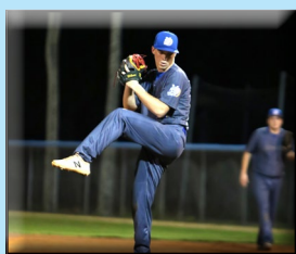
Spring sports wrap up, 4 teams send players to State Page 4