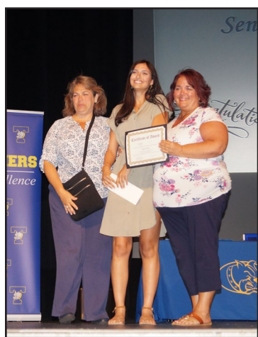
Hannah’s Heroes Scholarship Recipient