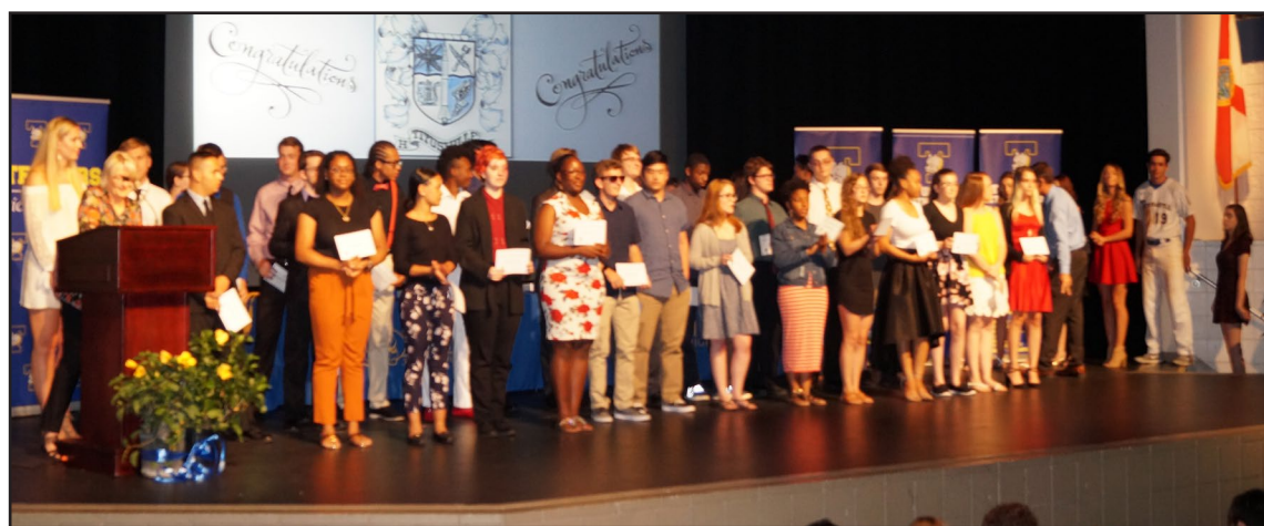
CTE Digital Design & Web Design Industry Certification Recipients