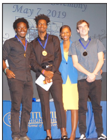
110% Award Winners