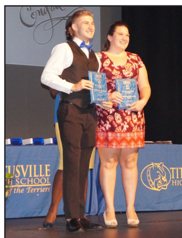
Foreign Language Department Awards