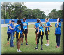
Powder Puff game played late this year on May 3 during spring sport pep rally Page 7