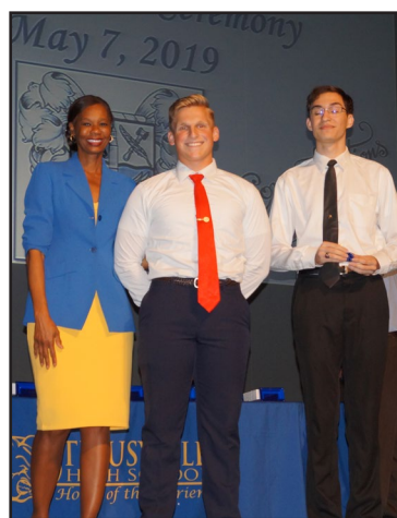
Perfect 1000 Score on MOS exam