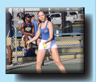
Spring sports wrap up, Girls' Tennis & Track only sports to boast post-season success Page 9