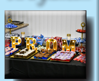
Prom big success at The Great Outdoors Page 2