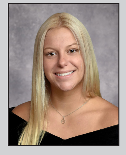
Outstanding Female Athlete of the year