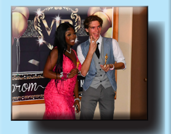
Senior Superlatives announced at Prom Page 3-4