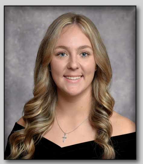
Hall of fame Leader