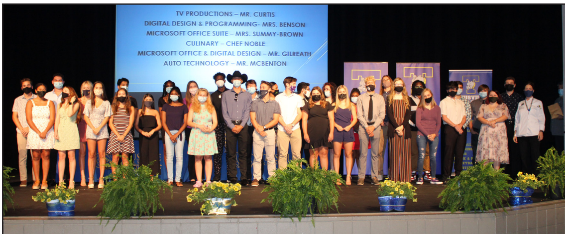
CTE Culinary Program Industry Certification Recipients