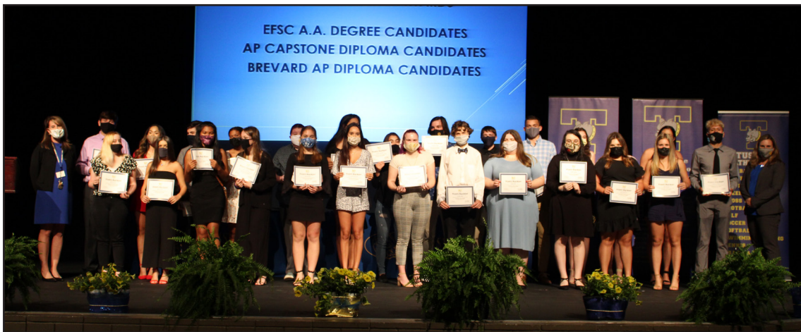
Seniors graduating with their Associates of Arts Degree from Eastern Florida State College