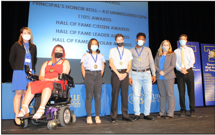
110% Award Winners