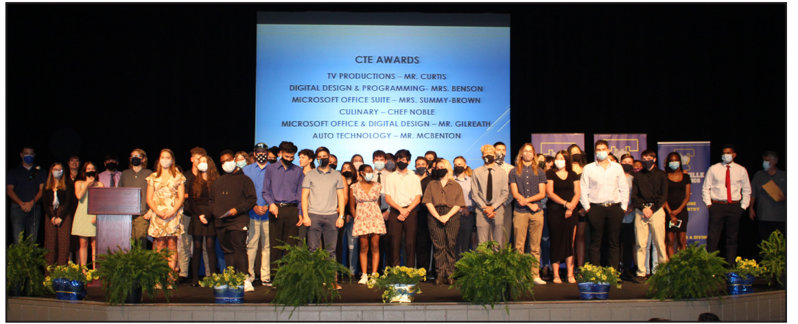
CTE Digital Design & Web Design Adobe Software Industry Certification Recipients