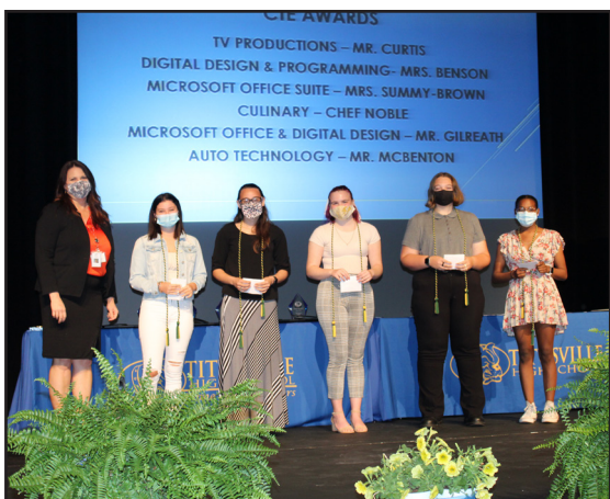
CTE CNA Industry Certification Recipients