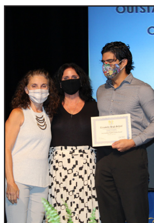
English Dept. Award