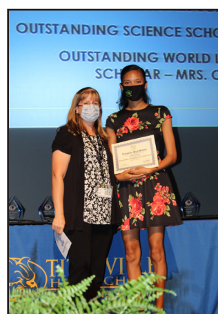
Science Dept. Award