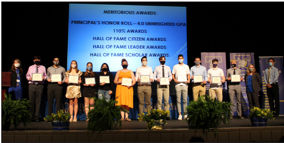
Principal's Honor Roll Award Recipients