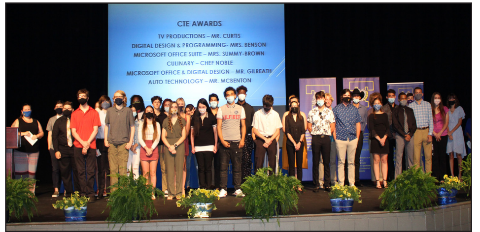
CTE Digital Info Tech Microsoft Office Industry Certified Recipients