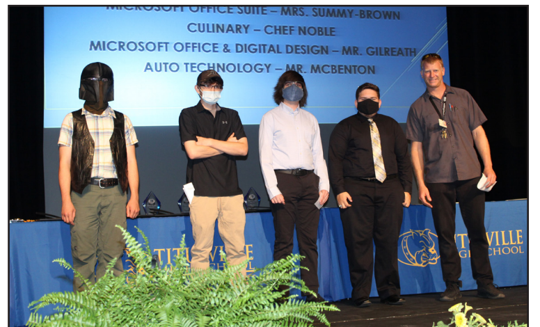
CTE Automotive Industry Certified Students