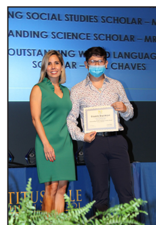
Foreign Language Dept. Award