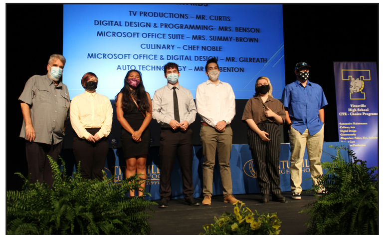
CTE TV Production Adobe Premiere Pro Industry Certification Recipients