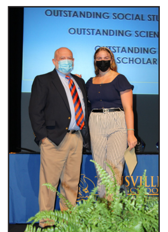
Social Studies Dept. Award