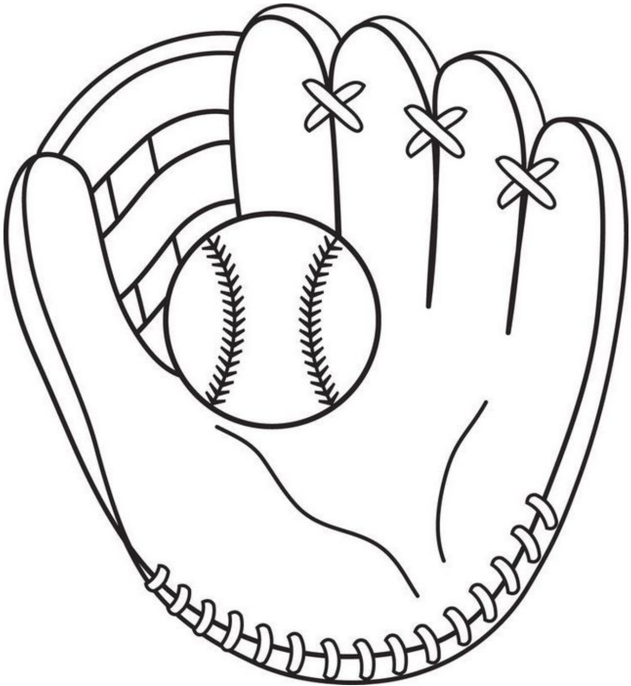
Softball Coloring Page