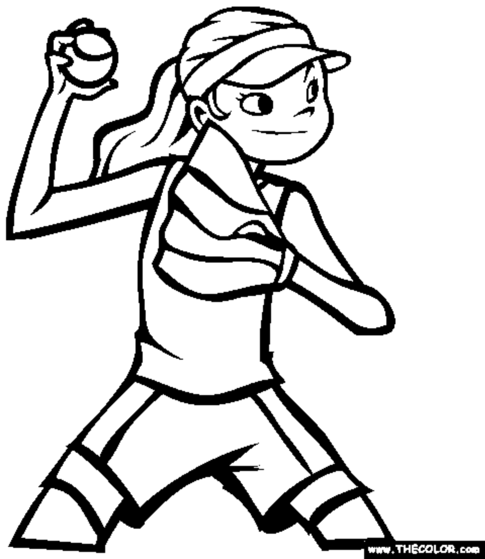
Softball Coloring Page