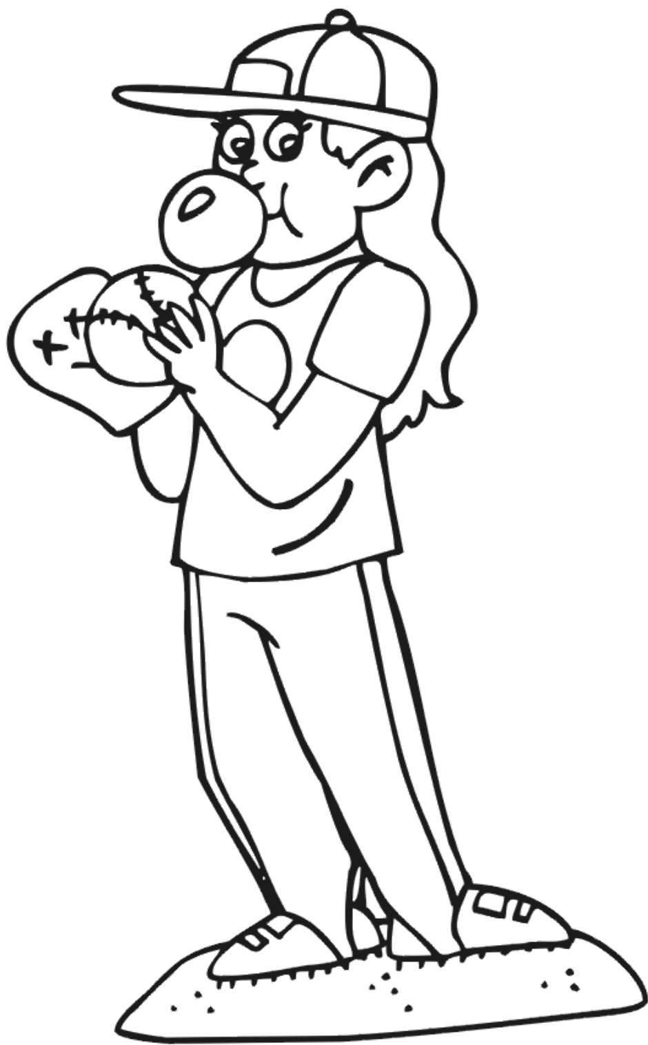
Softball Coloring Page