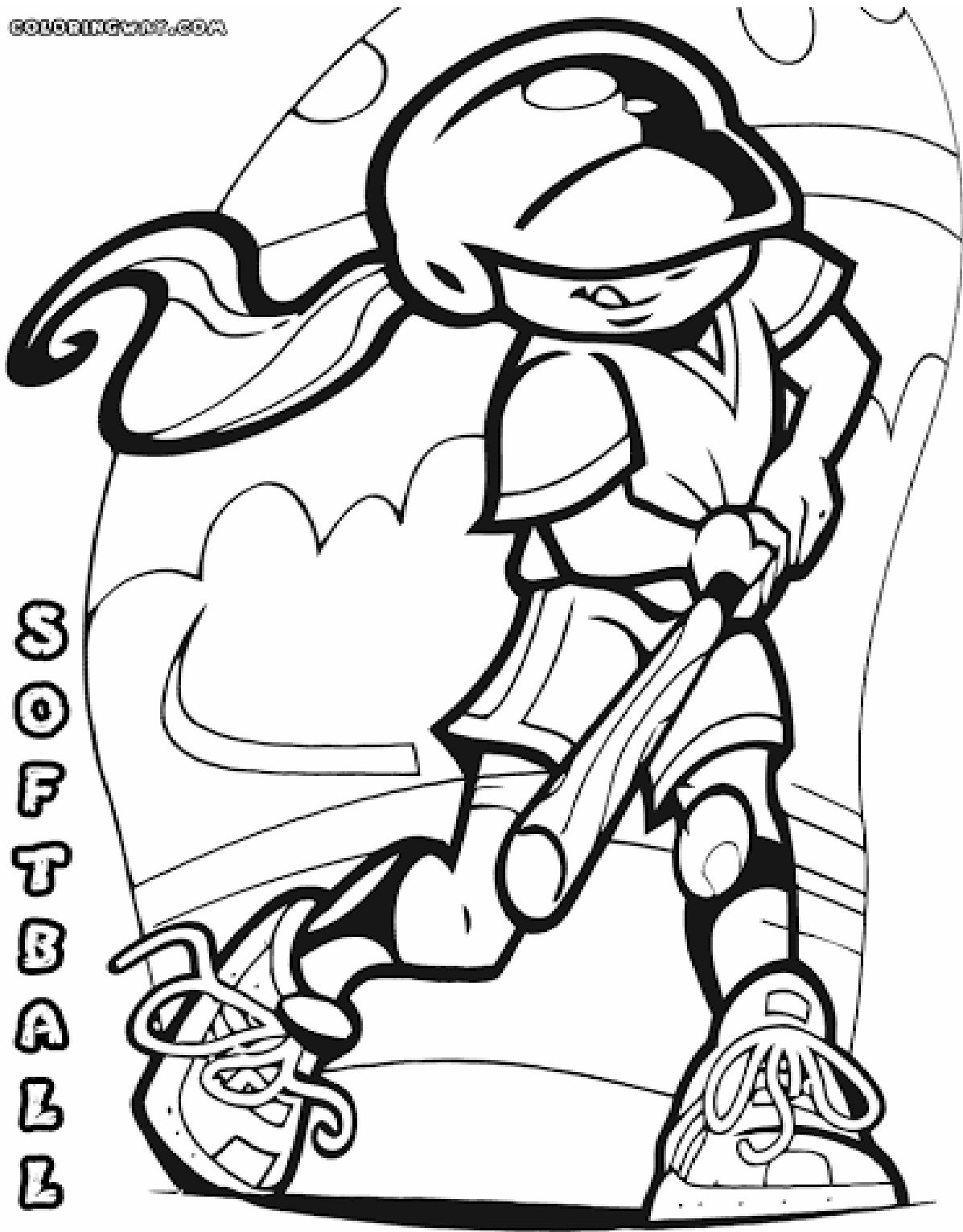
Softball coloring sheet