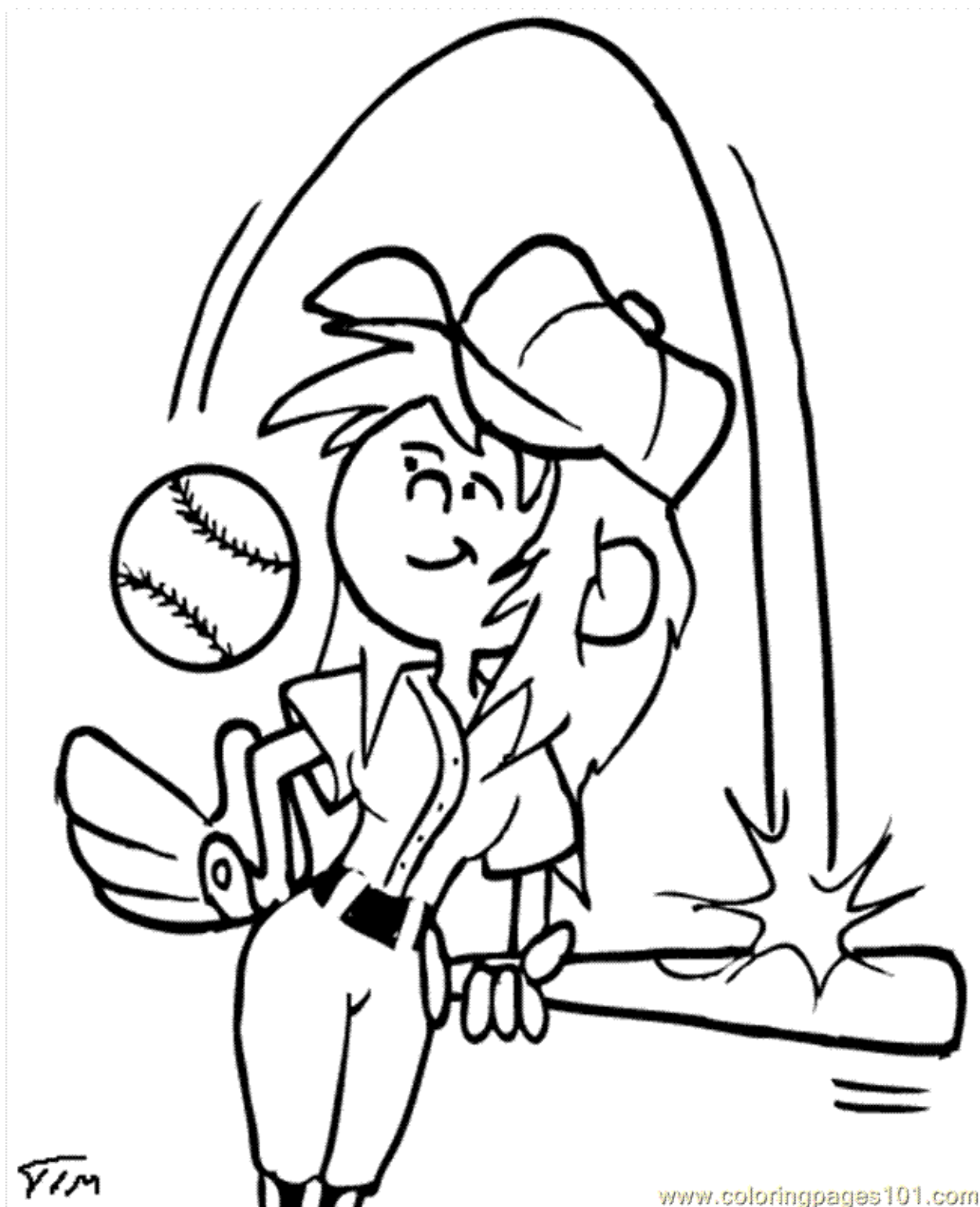
Softball Coloring Page