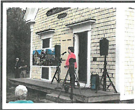
80th birthday celebration at the old schoolhouse.