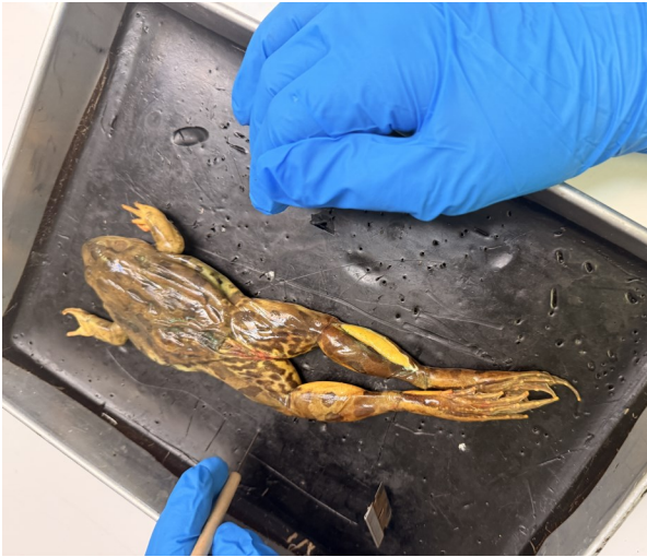
The seventh graders moved on to the frog dissection!