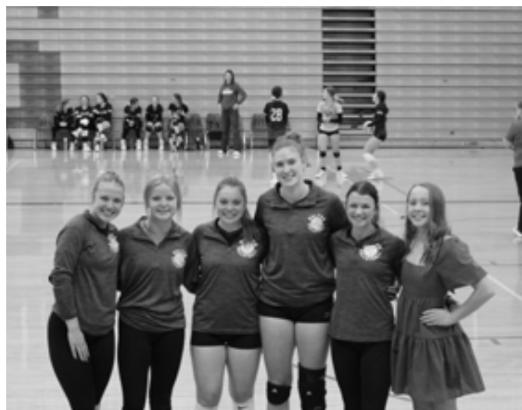
Senior Celebration: The varsity volleyball senior girls pose together for a group picture on their senior night.