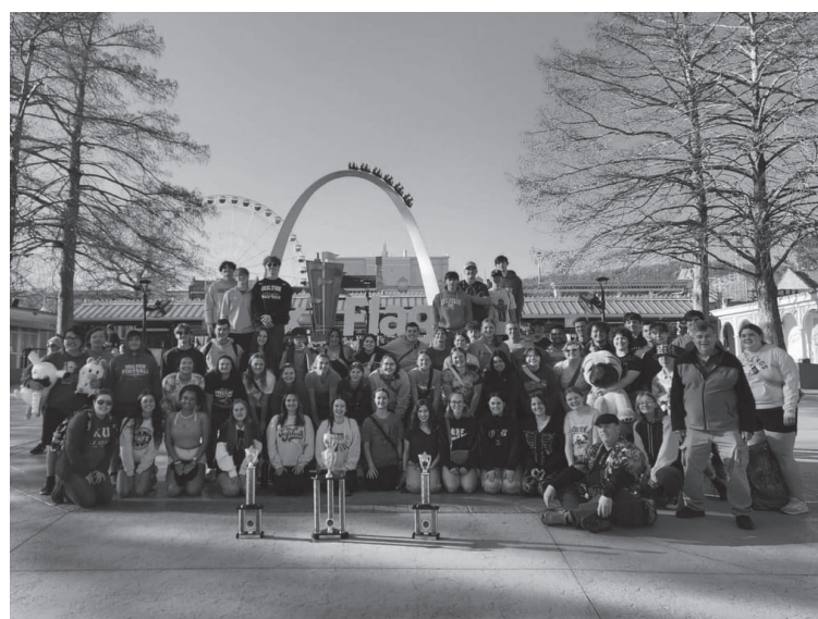
Bringing Home the Bacon: The band and the choir pose in front of the Six Flags sign after the awards ceremony. The ensembles spent all day exploring and riding rides at the amusement park before the awards ceremony.