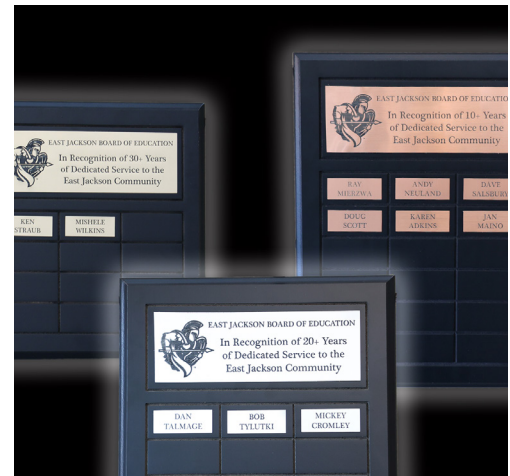
School Board Recognition Years of Service.