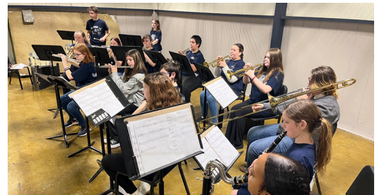
Members of the EJSS Pep Band playing during varsity basketball game