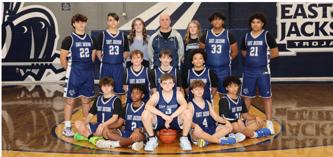
8TH GRADE BASKETBALL