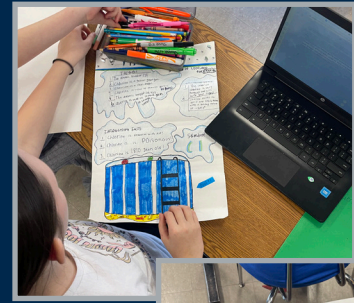
Sixth graders working on their Wanted Element posters for science.

All these successes and more are making it possible for our sixth-grade team to be prepared for and excited about the rest of this quickly passing school year!