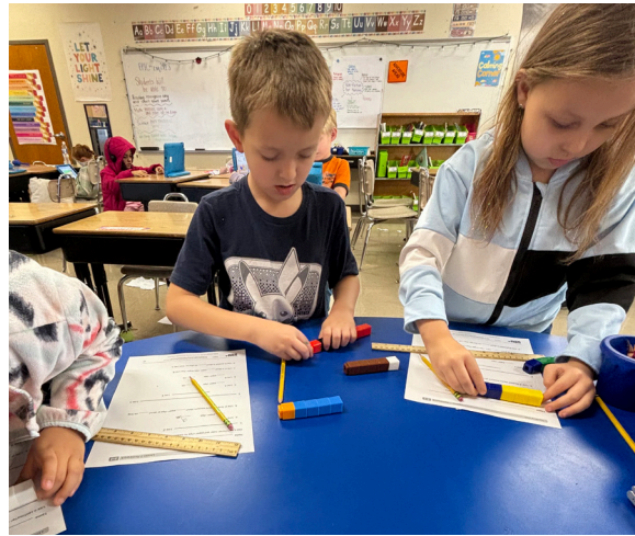
Second Graders using base 10 blocks in math.