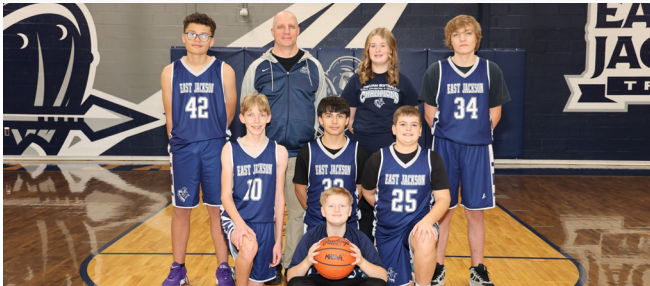
7TH GRADE BASKETBALL