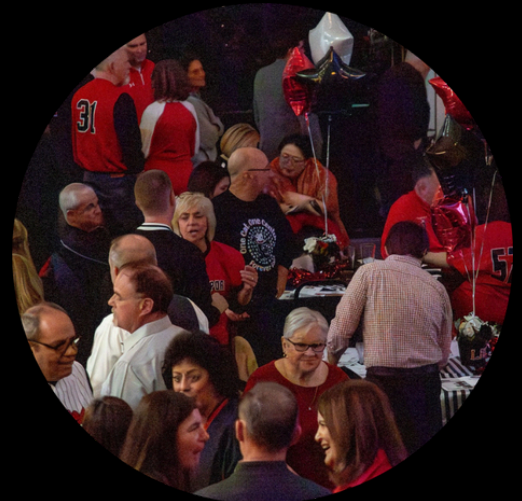
Alumni gather to reconnect and celebrate a night of Berry pride.