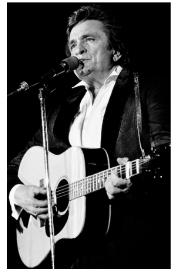
Cash performs at Berry Bowl June 25, 1983

Nearly fifty years later, after Amelia Earhart spoke in the “old” Berry Bowl, in July of 1983, as part of the Iron Horse Festival, country music legend Johnny Cash performed a concert in the “new” Berry Bowl, drawing a large crowd and further showcasing the venue’s role as a cultural centerpiece for the community. From aviation pioneers to music legends, the Berry Bowl has long been more than just a home for LHS sports. It has been a gathering place for the entire community.