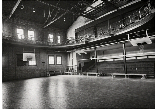
LHS Gym in 1915