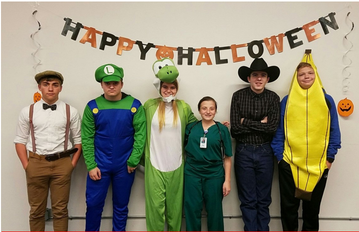
Dapper Guy, Luigi, Yoshi, a Nurse, a Cowboy, and a Banana Cove Speech and Debate Team members competed in Oktoberfest in Tillamook last weekend-costumes were required!