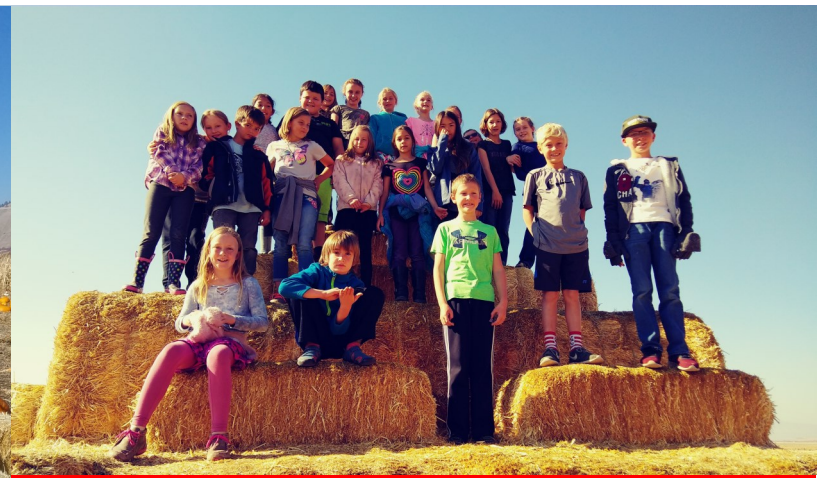
Above: 4th Grade out learning on a beautiful fall day