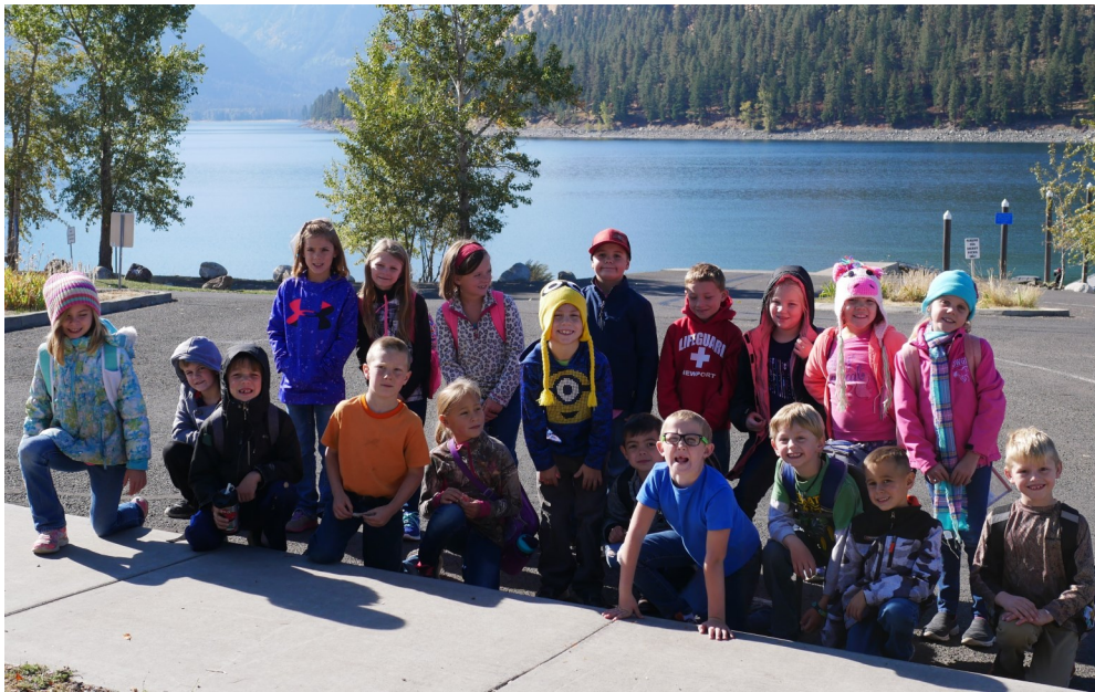
2nd Grade: Wallowa Lake — Preparing to hike the glacial moraine