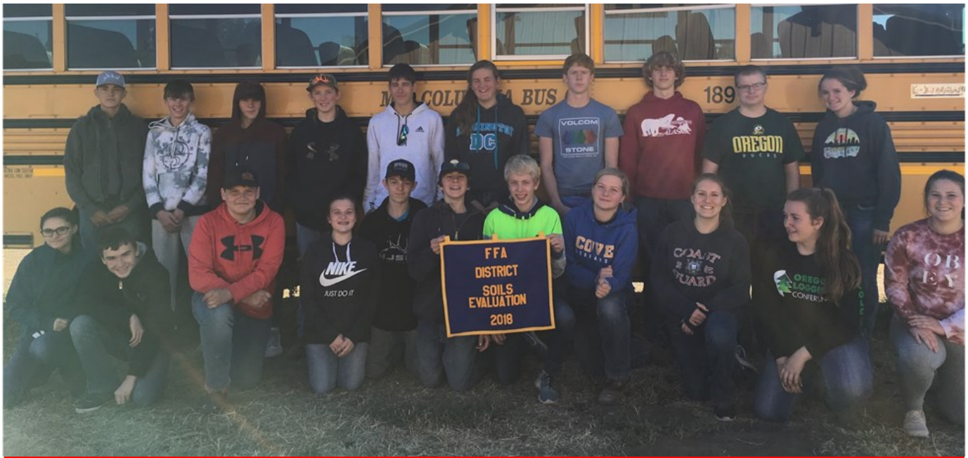
The soils judging group from the Cove FFA Chapter—winners of the blue (1st Place) banner